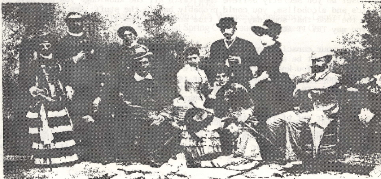
" I began to go meetings"